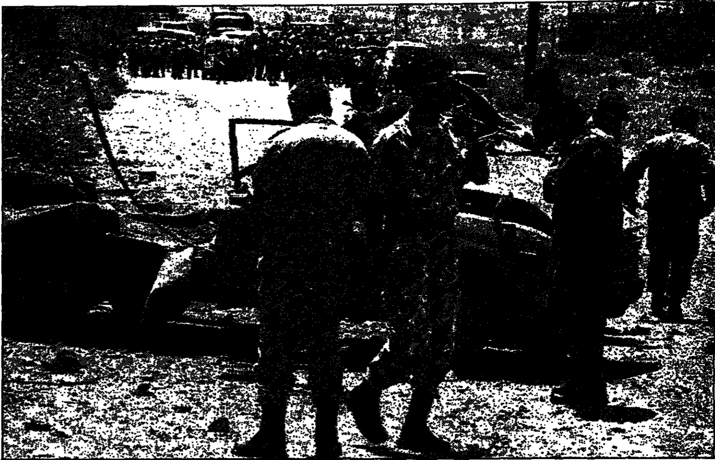
Lebanese policemen inspect a car damaged in a roadside bombing near Nabatiya in which two people were killed yesterday.

The IAF blasted Hizbullah targets in south Lebanon yesterday afternoon, as at least one gunman was reported to have been killed in heavy fighting in the region. Two Lebanese civilians were also killed and two others wounded in a roadside bombing on the outskirts of Nabatiya township, north of the security zone. Hizbullah accused Israel of being responsible for the bombing, saying it was the "worst violation by Israel of the [Grapes of Wrath] April understandings." Lebanese radio stations reported that the Lebanese government is expected to submit a complaint to the Grapes of Wrath monitoring group over the incident. It was not clear whether Hizbullah would use the civilian casualties as an excuse for Katyusha attacks. Hizbullah leaders have threatened rocket attacks on Galilee if the organization feels that the monitoring group is "no longer able to protect Lebanese civilians." According to reports from Lebanon, two construction workers who had been loading rocks onto a truck were killed. The reports said a number of bombs had been hidden in fiberglass moulds designed to look like rocks, and had exploded when the workers touched them. A man and his wife who were in a car nearby were wounded. Lebanese radio stations quoted Lebanese security sources as saying that they had enough evidence to implicate Israel in the blasts. There was no comment from the IDF, apparently because the mat-